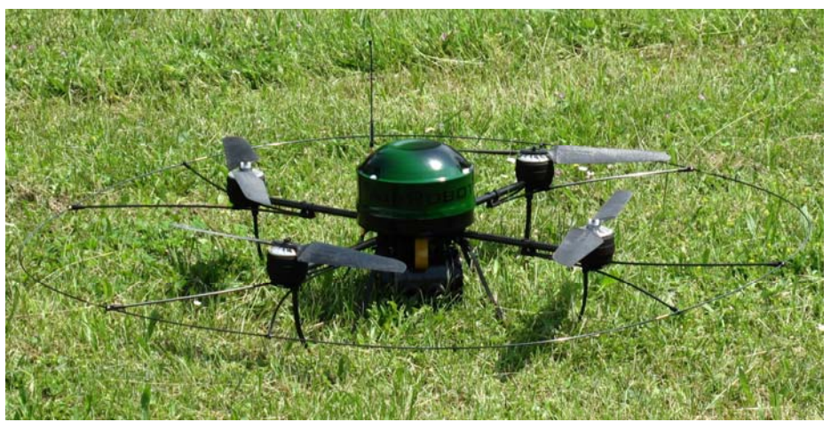
Fig. 1: A quadrocopter serves as flight platform

Other essential prerequisites are the possibility to add new sensors and payloads and the ability to interface with the UAV's control system in order to allow autonomous flight. A platform that fulfils these requirements is the quadrocopter AR100-B by AirRobot (s. Fig. 1). It can be both controlled from the ground station through a command uplink and by its payload through a serial interface. The latter feature was used to realize autonomous navigation (s. Section 4).