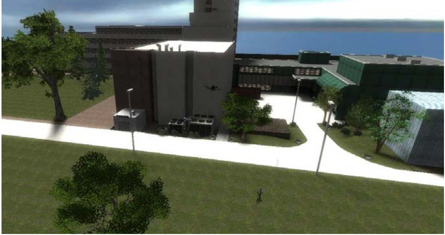
Fig. 5: Simulation of an intrusion scenario

An example scenario that simulates an intrusion has been implemented (s. Fig. 5). Besides the UAVs and the actors in the scenario, also sensors have been modeled. Different kinds of sensors such as motion detectors, cameras, ultra sonic or LIDAR (light detection and ranging) sensors can be modeled with their specific characteristics. The simulation tool can decide if an object lies within the range of a sensor. This helps evaluate and optimize the use of different sensing techniques.