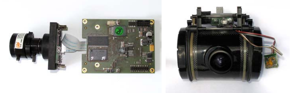
Fig. 4: A "smart" board-camera (left) controls the UAV and is carried as a payload (right)

To allow the highest degree of autonomy possible, the quadrocopter should be controlled by a micro computer that it carries as a payload. Due to space, weight and power constraints of the payload, this computer module has to be small, lightweight and energy-efficient. On the other hand, a camera as sensor system should not be left out. A perfect solution is the use of a "smart" camera, i.e. a camera that not only captures images but also processes them. Processing power and functionalities of modern smart cameras are comparable to PCs. Even though smart cameras became more compact in recent years, they usually still are too heavy to be carried by a quadrocopter. In most applications, smart cameras are used stationary where their weight is of minor importance. However, a few models are available as board cameras, i.e. without casing and the usual plugs and sockets (s. Fig. 4, left). Thus, their size and weight is reduced to a minimum. The camera we chose has a freely programmable DSP (400MHz, 3200MIPS), a Linux-based real-time operating system and several interfaces (Ethernet, I<sup>2</sup>C, RS232). With its weight of only 60g (without lens), its compact size and a power consumption of 2.4W it is suitable to replace the standard video camera payload.